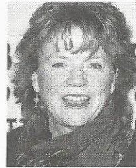
BECKY ANN BAKER

Becky Ann Baker (76-78, 82-85, 95) was seen recently in THE GOOD FIGHT on CBS as well as IFC's BROCKMIRE. She was a regular on HBO's GIRLS and has logged recent appearances on THE GOOD WIFE, MADAM SECRETARY and GOTHAM. Dana Delaney (77, 78) appeared on CBS's BULL and was recently on the Amazon original series HAND OF GOD as well as having a few projects in post production.